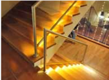
KICH LED RAILING KICH Architectural Products Pvt. Ltd.