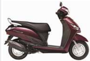
CYGNUS ALPHA India Yamaha Motor Private Limited