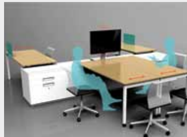
DFINE STORAGE BASED SYSTEM FURNITURE Godrej Interio