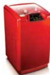
GODREJ EON FULLY AUTOMATIC TOP LOAD Godrej & Boyce Mfg. Co. Ltd.