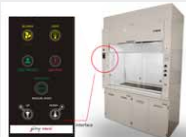
AEOLUS Godrej & Boyce Mfg. Co. Ltd.