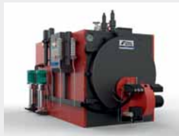
MARSHALL B PACKAGED STEAM BOILER Forbes Marshall Pvt. Ltd.