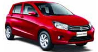
CELERIO Maruti Suzuki India Limited