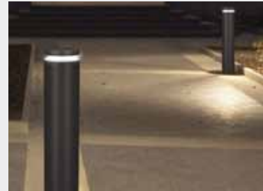
SLEEK AJNA BOLLARD K-Lite Industries