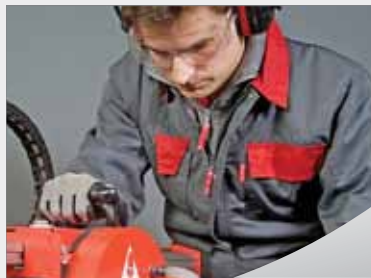
INDUSTRIAL WORK WEAR (GOTLAND) Mallcom (India) Limited