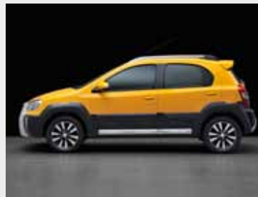
ETIOS CROSS Toyota Motor Corporation