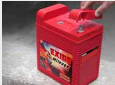
EXIDE MILEAGE FOR FOUR WHEELERS Exide Industries Limited