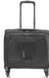
IMPAQ PRO SPINNER LAPTOP VIP Industries Limited