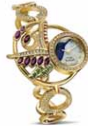
HUMMINGBIRD Titan Company Limited