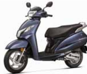
ACTIVA 125 Honda Motorcycle & Scooter India Private Ltd.