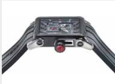
HTSE ROVER Titan Company Limited