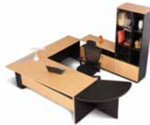
PRESIDENCY Wipro Enterprises Limited