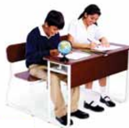
GENII-SCHOOL DESK AND BENCH Godrej Interio