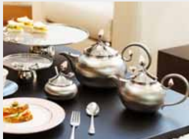
PINK BLOOM COLLECTION JSL Lifestyle Limited