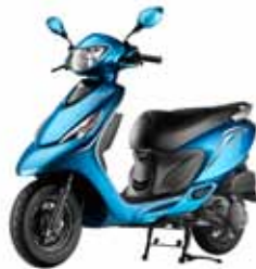
TVS SCOOTY ZEST 110 TVS Motor Company Ltd.