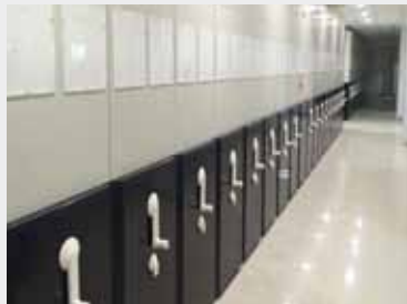
MOBISTACK Godrej & Boyce Mfg. Co. Ltd.