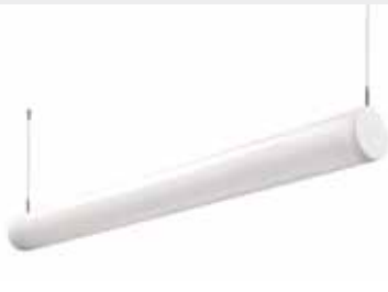
TUBO LED Wipro Enterprises Ltd.