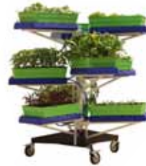
GROEZEE KITCHEN GARDEN SYSTEM Design Directions Pvt Ltd