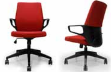
ONAIR Wipro Enterprises Limited