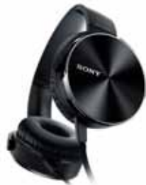
EXTRA BASS HEADPHONES Sony Corporation