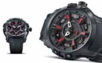
HTSE - X2 Titan Company Limited