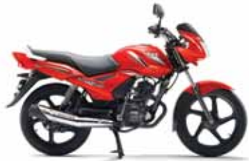
STAR CITY + TVS Motor Company Ltd.