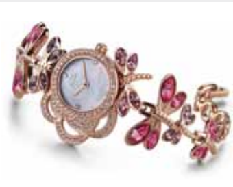
DRAGONFLY Titan Company Limited