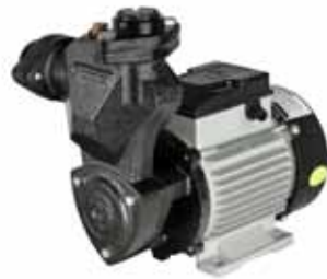
MINI PACIFIC Crompton Greaves Limited