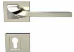
TWIST MORTISE HANDLE Godrej Locking Solutions & Systems