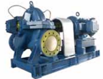
LOWEST LIFE CYCLE COST SERIES PUMPS (LLC) Kirloskar Brothers Limited, Kirloskarwadi