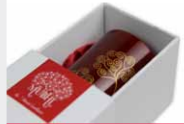
ALLVAZE - LOVE Mubhi Lifestyle Pvt. Ltd.