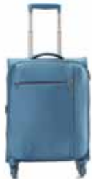
VIP SPACELITE EXP 360° VIP Industries Limited