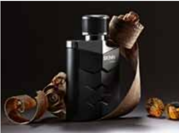
6-PACK Titan Company Limited