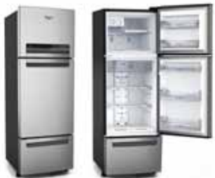
WHIRLPOOL'S PROTON WORLD SERIES REFRIGERATORS Whirlpool of India Ltd.