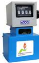
METER FOR VOLUMETRIC MEASUREMENT Neogi Technologies and Research Private Ltd.