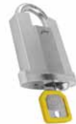
GODREJ 3KS SHROUDED BRASS PADLOCK Godrej & Boyce Mfg Co Ltd.