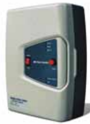
GSM PUMPSET CONTROLLER Crompton Greaves Limited