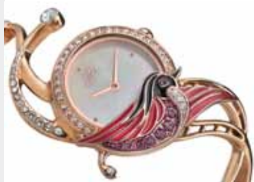
RAGA GARDEN OF EDEN - 'BIRD OF PARADISE' Titan Company Limited