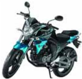
FZ India Yamaha Motor Private Limited