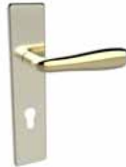
PRIMORDIAL MORTISE HANDLE Godrej Locking Solutions & Systems