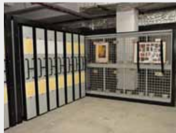
ART STORAGE SYSTEM Godrej & Boyce Mfg. Co. Ltd.