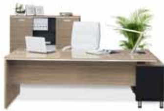
ZARA SERIES DESK Debono Flexcom (I) Ltd.