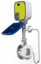
AIRMON Forbes Marshall Pvt. Ltd.