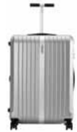
STARK 55 STR 4W 360° VIP Industries Limited