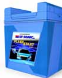
SF SONIC BATTERIES FOR FOUR WHEELERS Exide Industries Limited