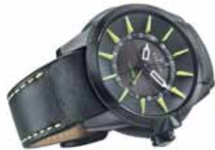
TITAN HTSE 1629 Titan Company Limited