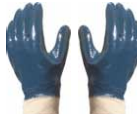
INDUSTRIAL HAND GLOVES (MFKB) Mallcom (India) Limited