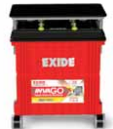
EXIDE INVAGO Exide Industries Limited