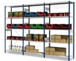
MODULAR CLIP ON SHELVING Godrej & Boyce Mfg. Co. Ltd.