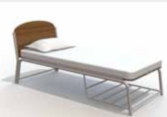
ABODE Wipro Enterprises Limited