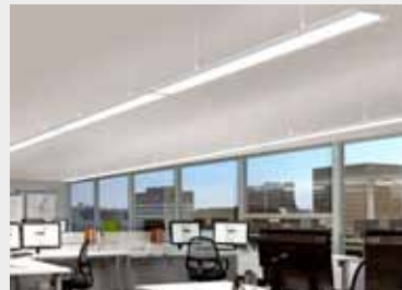
ASLIMLINE LED Wipro Lighting