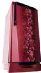
GODREJ EDGE DIGI REFRIGERATOR RANGE Godrej & Boyce Mfg. Co. Ltd.