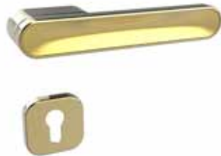
CAPSULE MORTISE HANDLE Godrej Locking Solutions & Systems